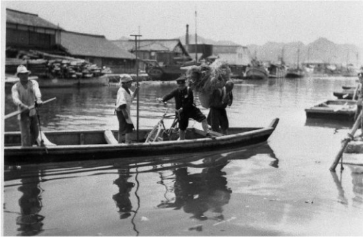
The Ferry of Kagawazu