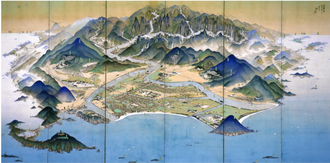
“The bird’s-eye view of Hagi city” (1932), painted when this city organized as a municipality

Hatsusaburo Yoshida painted a lot of sightseeing maps of bird’s-eye view when a network of rails began to get organized through Japan. Not only historic sites, noted places for cherry blossoms and sea bathing places, but also Hagi pottery shops and hotels were drawn.