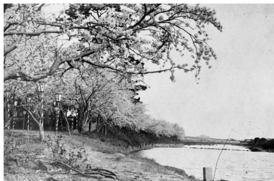
Cherry trees on the bank of Kawashima