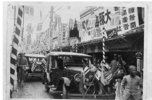
Celebration of the completion of the Sanin Line