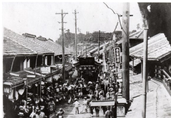
The pictures of “the Hometown · Hagi” taken in the 1930s

We can get a glimpse of a tender-hearted life of “the Hometown” through a lot of pictures taken in the 1930s.