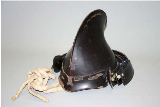
Eboshi-typed helmet worn by Shinsaku Takasugi when he took up arms at Shimonoseki