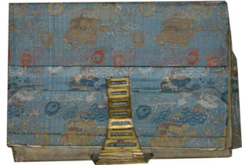
Purse carried by Toshimaro Yoshida at the Ikedaya Incident