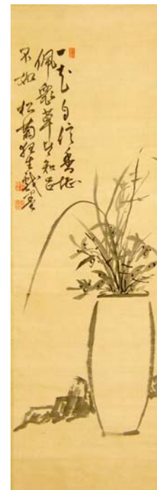
Drawing of orchids drawn by Kogoro Katsura for the fun of it